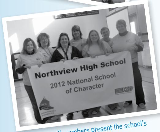
Northview staff members present the school's National School of Character banner.